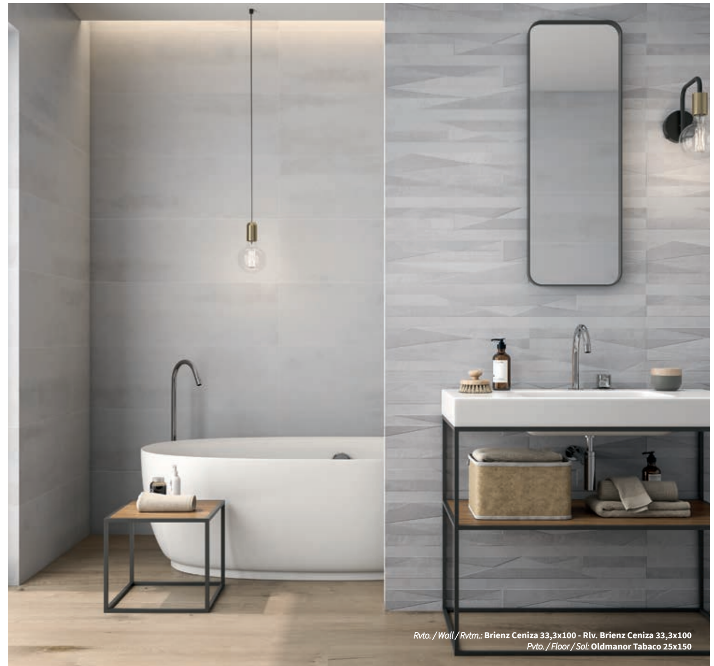
Rvto. / Wall / Rvtn.: Brienz Ceniza 33,3x100 - Rlv. Brienz Ceniza 33,3x100 Pvto. / Floor / Sol: Oldmanor Tabaco 25x150