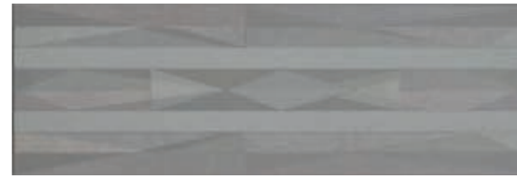
Rlv. Brienz Marengo ● 33,3x100 Rec. M64 031.627.0028.03817