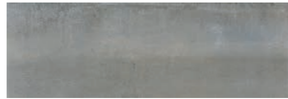
Brienz Marengo ● 33,3x100 Rec. M64 031.627.0028.02985