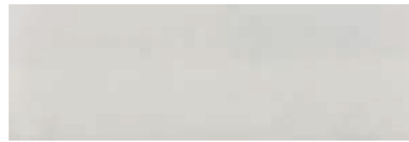
Brienz Blanco ● 33,3x100 Rec. M64 031.627.0012.02985